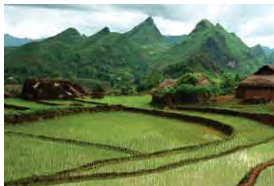
Japan collaborates in applying DREB genes to develop novel crop varieties that tolerate drought, salinity and low temperature.

JIRCAS's past contributions are legion. For example, it introduced to the world the dehydration responsive element binding (DREB) genes in the model plant Arabidopsis thaliana . DREB genes control the expression of more than 40 Arabidopsis genes responsible for tolerance to such environmental stresses as drought, salinity and low temperature. Using these genes, JIRCAS has started collaborative projects with several CGIAR Centers to develop novel varieties of resilient crops.