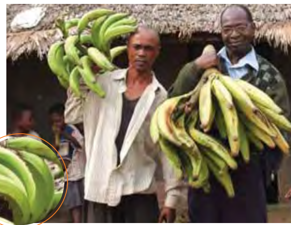
Horn plantain is collected in the village of Yalokombe in eastern Democratic Republic of Congo for conservation and exchange.

The recent emergence of political stability presents many opportunities for new partnerships to improve crops, forestry, aquaculture and fisheries