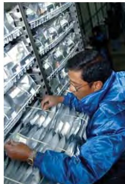
CGIAR genebanks hold the world's largest collections of plant diversity for food and agriculture.

The in-trust crop genetic resources are vital to the CGIAR's achieving its objectives, particularly the