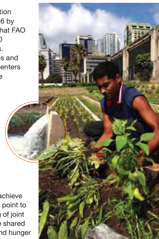
FAO-CGIAR collaboration will enable better decisions on water and agriculture management over the next half century.

Budget limitations and the need for greater efficiency and effectiveness in the drive to achieve the Millennium Development Goals (MDGs) point to a need for the periodic review and updating of joint activities between FAO and the CGIAR. The shared challenge of eradicating extreme poverty and hunger (MDG 1), while ensuring environmental sustainability (MDG 7), is a natural starting point for focusing cooperative work. An FAO-CGIAR joint program for the rehabilitation of agricultural and forestry research for food security in the Democratic Republic of Congo, initiated in 2006 and funded by the European Commission, is one good example (see page 13).