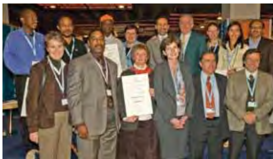
Winners of 2006 Innovation Marketplace with judges and the CGIAR chair.

Eat Orange! combats malnutrition in sub-Saharan Africa, where more than 40% of children under age 5 are vitamin A deficient, significantly worsening their risk of blindness and death. A partnership of Helen Keller International (HKI), HarvestPlus Challenge Program and International Potato Center, Eat Orange! launched an aggressive educational and marketing campaign to promote vitamin A-rich orange-fleshed sweetpotatoes, prompting more than 115,000 families in Burkina Faso, Mozambique and Niger to incorporate the healthful tubers into their diets.